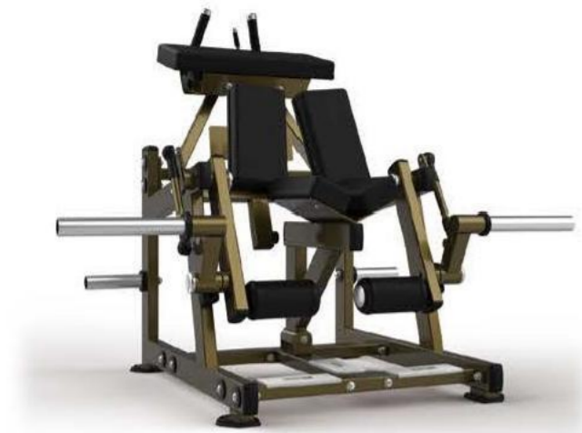
LD-2002 KNEELING LEG CURL

> Dimension:1200x1650x1350mm 47.2x65x53.1in N.W/G.W:145kg 320lbs/155kg 342lbs