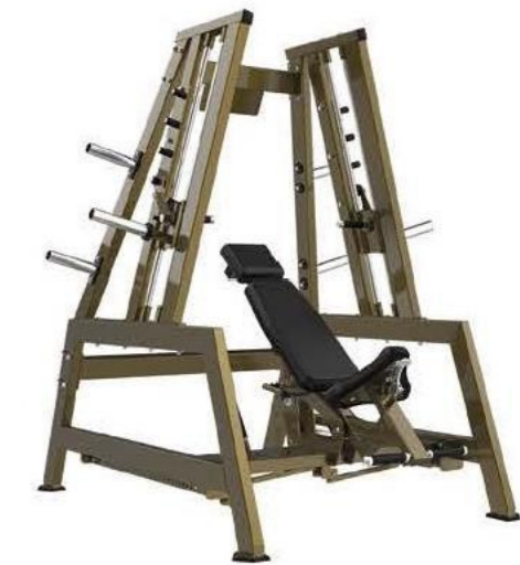
LD-1008 DUAL TOWER SMITH MACHINE