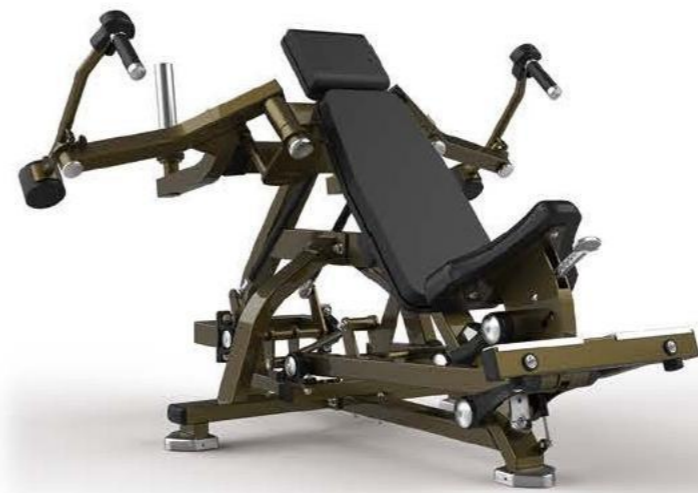
LD-1013 PECTORAL MACHINE

> Dimension:1475x1445x1045mm 58x56.9x41.1in > N.W/G.W.:130kg 286lbs/138kg 304lbs