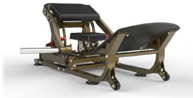
LD-2005 BUTTOCKS BRIDGE

Dimension:1635x1800x800mm 64.4x70.9x31.8in > N.W/G.W:160kg 353lbs/170kg 375lbs