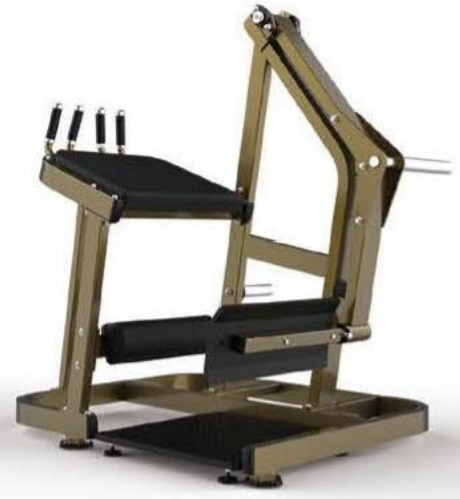
LD-2008 GLUTE MACHINE

> Dimension: 1330x1120x1580mm 52.3x44.1x62.2in ▶ N.W/G.W: 140kg 309lbs/150kg 330lbs