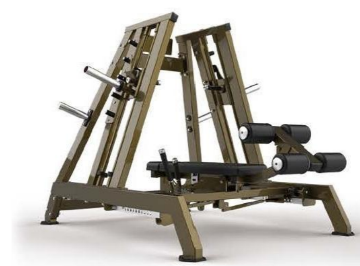
LD-1007 DUAL BENCHSMITH MACHINE