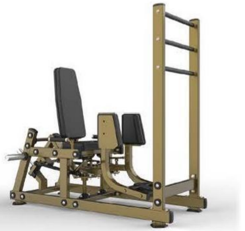
LD-2009 HIP ABDUCTOR

> Dimension: 1865x1052x1589mm mm 73.4x41.4x62.6in N.W/G.W: 145kg 320lbs/170kg 342lbs