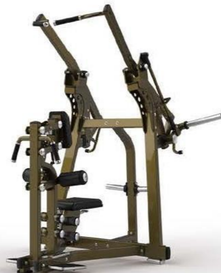
LD-1012 FRONT LAT PULLDOWN

Dimension:1620x1775x2090mm 63.8x69.9x82.3in > N.W/G.W.:196kg 485lbs/209kg 507lbs