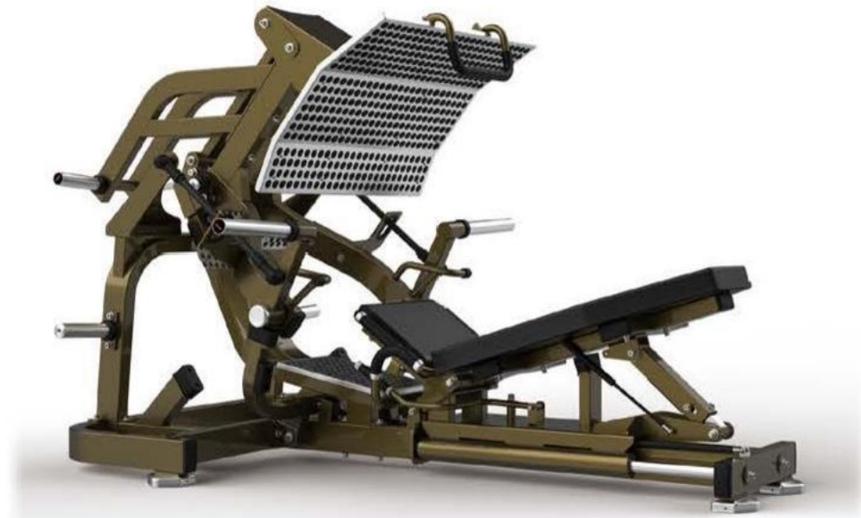
LD-2011 LEG PRESS

> Dimension: 2653x1600x1560mm mm 1044x630x614in N.W/G.W: 500kg 1102lbs/540kg 1190lbs