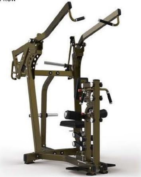
LD-1006 HIGH ROW