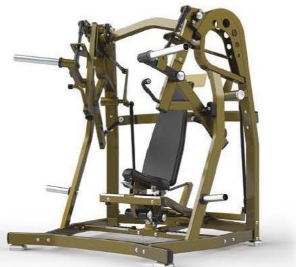
LD-1010 WIDE CHEST

Dimension:1620x1465x1738mm 63.8x57.8x68.4in > N.W/G.W.:242kg 534lbs/252kg 556lbs