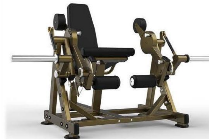
LD-2001 SEATED LEG EXTENSION

Dimension:1550x1900x1200mm 61x74.8x47.2in > N.W/G.W.:122kg 269lbs/132kg 291lbs