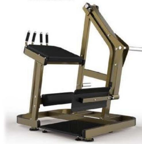
LD-2008 GLUTE MACHINE

> Dimension:1330x1120x1580mm 52.3x44.1x62.2in > N.W/G.W:140kg 309lbs/150kg 330lbs