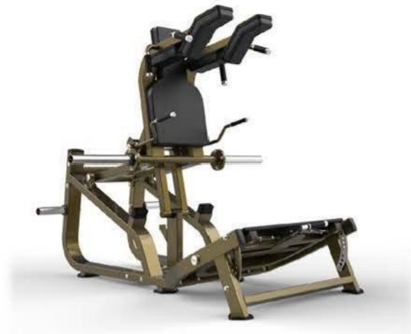
LD-2003 BOTHWAY SQUAT

> Dimonsion:1905x1520x1610mm 76.4x61x61.6in > N.W/G.W:205kg 452lbs/215kg 474lbs