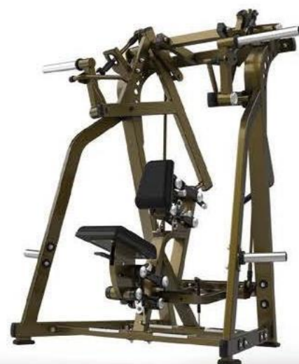
LD-1011 LEVEL ROW

Dimension:1786x1435x1956mm 70.3x56.5x77in > N.W/G.W.:235kg 518lbs/245kg 540lbs