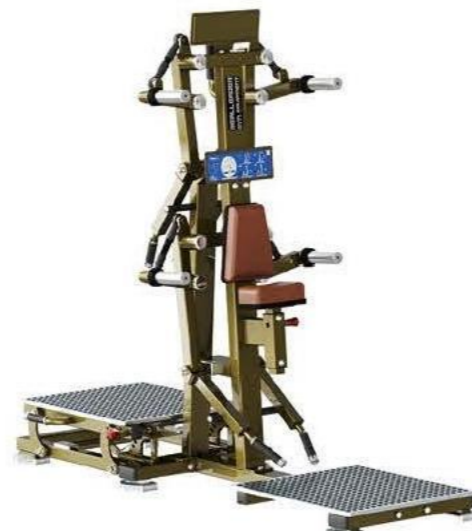
LD-1004 LATERAL RAISE/REAR DELTOID