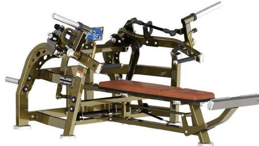
LD-1002 Horizontal Bench Press