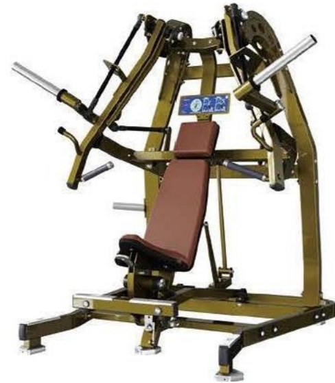
LD-1001 CHEST PRESS