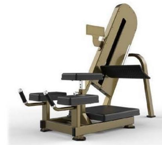
LD-2007 GLUTE MACHINE

Dimension:2022x1543x1101mm 79.6x60.7x43.3in > N.W/G.W:146kg 322lbs/146kg 344lbs