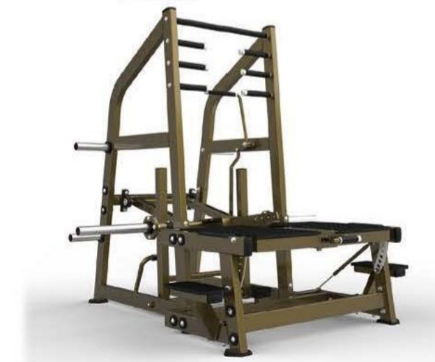
LD-2004 BELT SQUAT

> Dimension:1580x1650x1680mm 62.2x65x66.1in > N.W.G.W:240kg 529lbs/250kg 551lbs