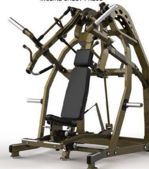
LD-1015 INCLINE CHEST PRESS

> Dimension:1350x1550x1830mm 53.1x61x72in > N.W/G.W.:245kg 540lbs/255kg 562lbs