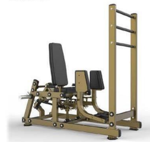
LD-2009 HIP ABDUCTOR

> Dimension:1865x1052x1589mm mm 73.4x41.4x62.6in N.W/G.W:145kg 320lbs/170kg 342lbs