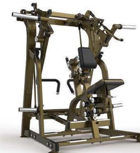
LD-1014 LOW ROW

> Dimension:1485x1850x1751mm 58.5x72.8x68.9in > N.W/G.W.:140kg 308lbs/150kg 330lbs