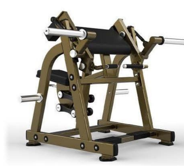
LD-1005 SEATED BICEPS CURL