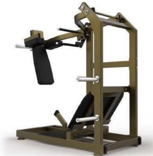
LD-2006 PENDULUM SQUAT

Dimension:2003x890x1835mm 78.9x35x72.2in > N.W/G.W:223kg 492lbs/170kg 514lbs